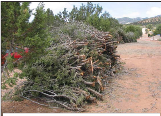
Good example of stacked piles for chipping.