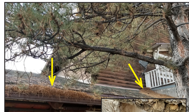
Needles and leaf litter in your gutters, on corners of roofs, and under stairs and decks can be easily ignited by landing embers.