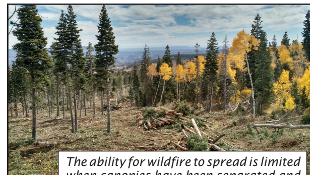
The ability for wildfire to spread is limited when canopies have been separated and branches have been limbed up.